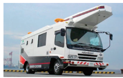
Road surface property investigation