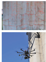
Inspection applying photographic technology (by our own UAV)