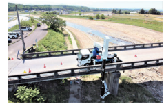
Inspection by our own bridge inspection vehicle