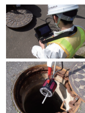
Inspection by pipe opening camera