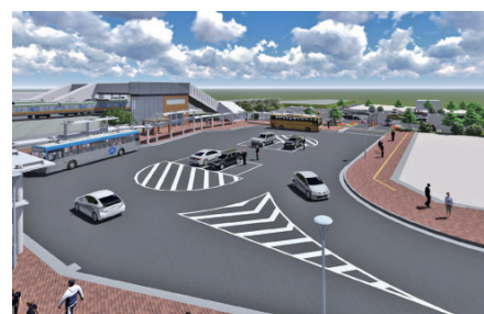
Within the land readjustment district station square design