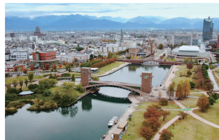
General park design